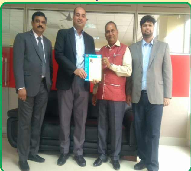
Presenting ILTES News Letter at GDU Hararyana