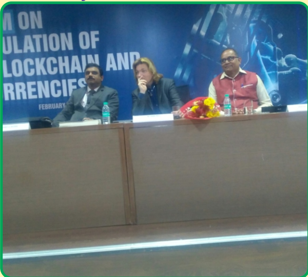
Blockchain Symposium at GD University Hararyana