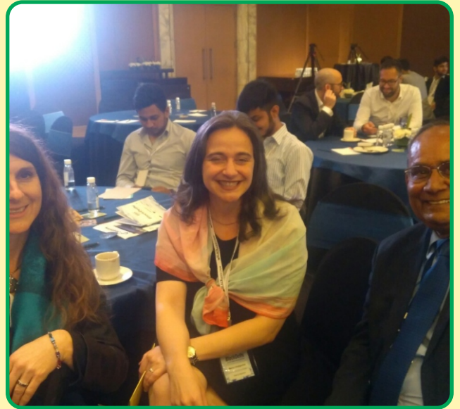
With Delegates of International Conference on Blockchain at New Delhi