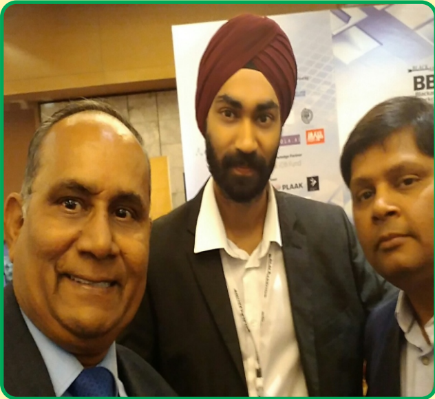
With Delegates of International Conference on Blockchain at New Delhi