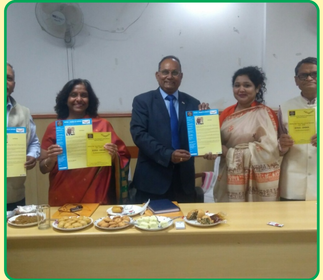
Release of First ILTES News Letter at BU- Bhopal