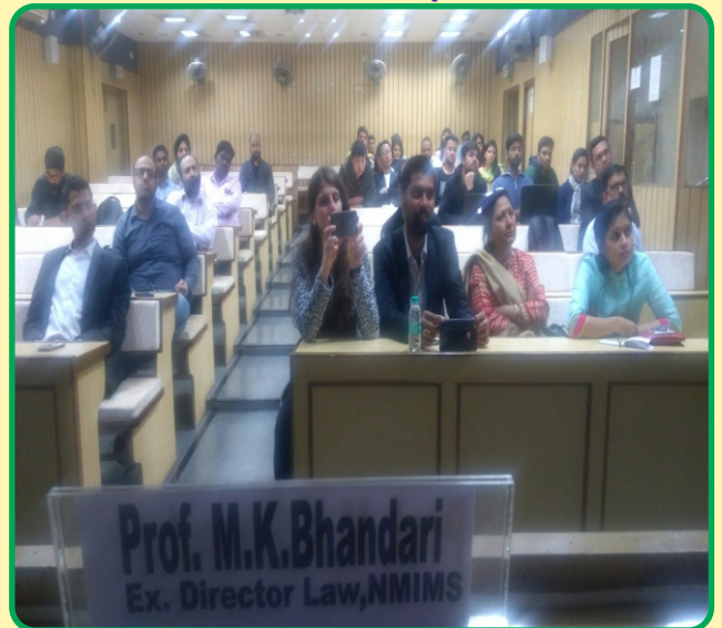
Lecture on Cryptocurrency at ILI Delhi