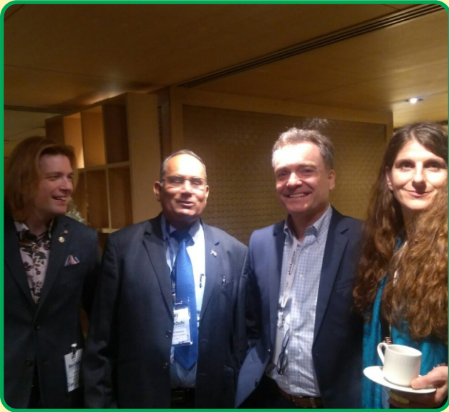
With Delegates of International Conference on Blockchain at New Delhi